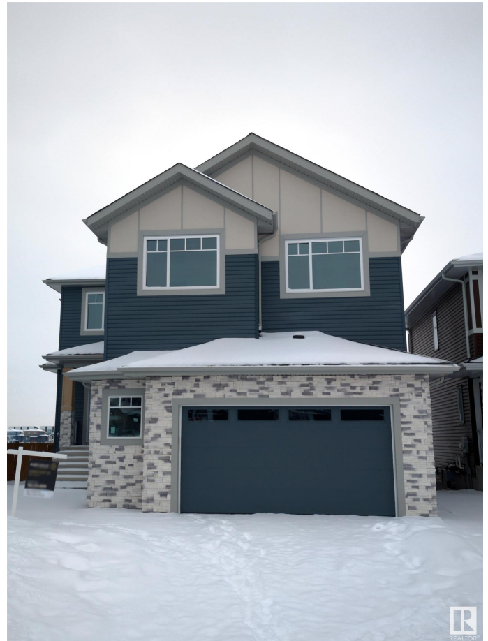
91 Edgefield Wy, St. Albert, AB

2 Storey 2,848 +/- SF on a Walk-Out lot onto the Pond. Fully fenced and Landscaped Plus 1,193 +/- SF Bsmt developed. TOTAL 4,041 +/- SF developed. Designed for family enjoyment plus large gatherings! Enjoy tranquility watching the Sunset over the pond. Covered deck off Dining Room, Primary Suite and at ground level patio. Huge Spa style Ensuite - separate water closet. Double vanity. Invigorate in the spa shower or relax in the huge soaker tub. 3 additional Bedrooms on the same floor all with 4 Pce Bathrooms. Plus, main floor den/bedroom with adjacent full bath. 5th Large Bsmt. Bdrm. Large Kitchen Plus a full 2nd Kitchen. Entertain guests in the Living Room while others relax in the Bonus Room overlooking the Great Room or bsmt family room c/w wet bar w bar stool height island or enjoy the games room. Open design allows flow of natural light thru-out. Store your toys™ in the oversized garage. Access to the Park/Pond/Pathways. Major Shopping, Schools, Recreation Facilities, Major/Minor Arterial Roads