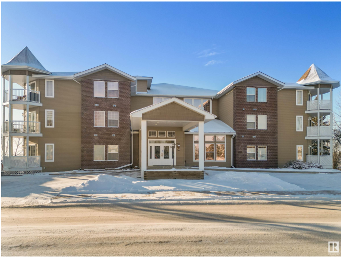
102-4128 47 St, Drayton Valley, AB