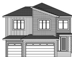
Mirage II - Prairie Modern