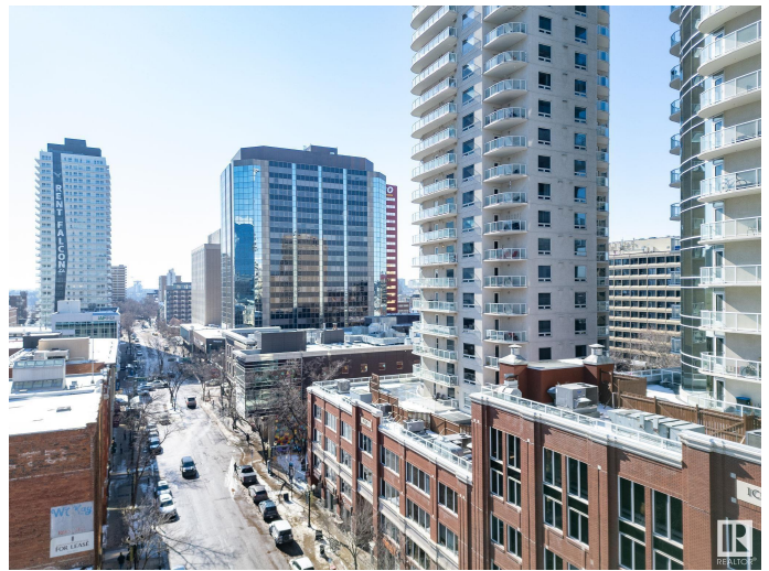
701-10136 104 Street NW, Edmonton, AB