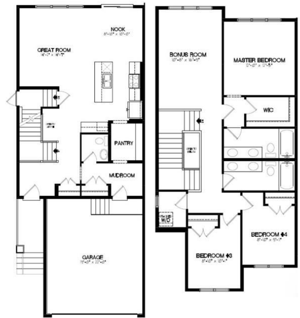
MAIN FLOOR - 864 SQFT

Data is supplied by Pillar 9â„¢ MLSÂ® System. Pillar 9â„¢ is the owner of the copyright in its MLSÂ® System. Data is deemed reliable but is not guaranteed accurate by Pillar 9â„¢. The trademarks MLSÂ®, Multiple Listing ServiceÂ® and the associated logos are owned by The Canadian Real Estate Association (CREA) and identify the quality of services provided by real estate professionals who are members of CREA. Used under license.