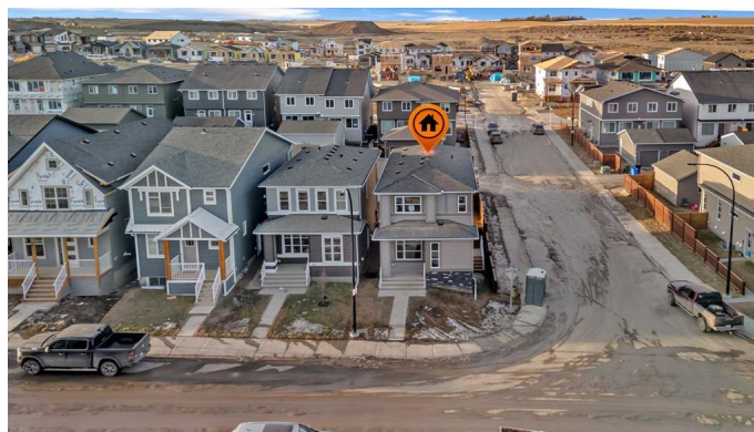
71 Herron St NE, Calgary, AB

Main Floor Exterior Area 914.55 sq ft Interior Area 834.87 sq ft